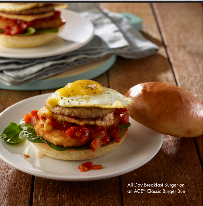
All Day Breakfast Burger on an ACE® Classic Burger Bun

ACE® burger buns offer a high, golden crown which provides maximum visual appeal and commands a higher price on your menu. Our buns have a soft bite, a clean flavour, and are resilient enough to stand up to toppings and sauces — especially during delivery.