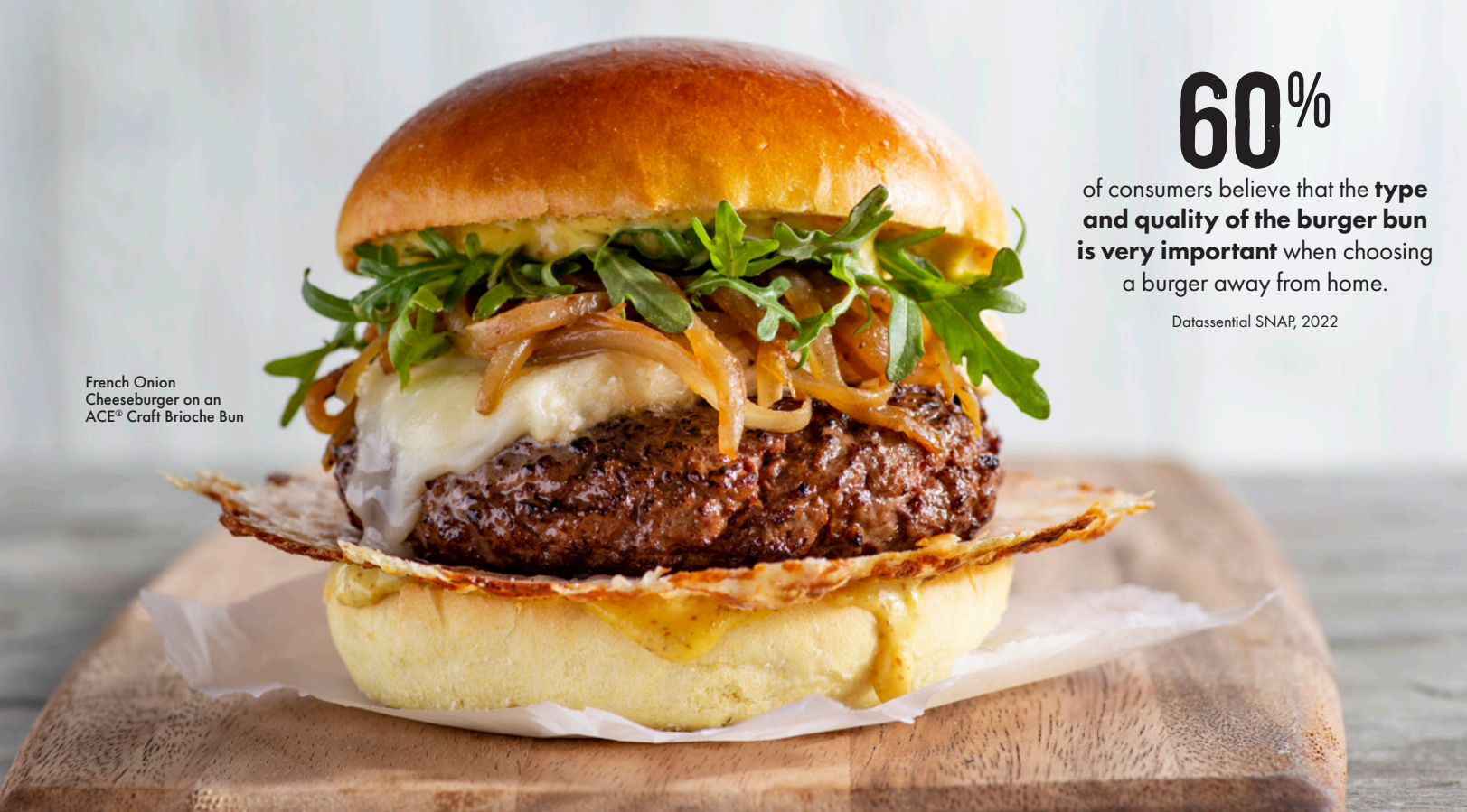
French Onion Cheeseburger on an ACE® Craft Brioche Bun

GO AHEAD, SQUEEZE OUR BUNS — THEY'LL ALWAYS BOUNCE BACK!