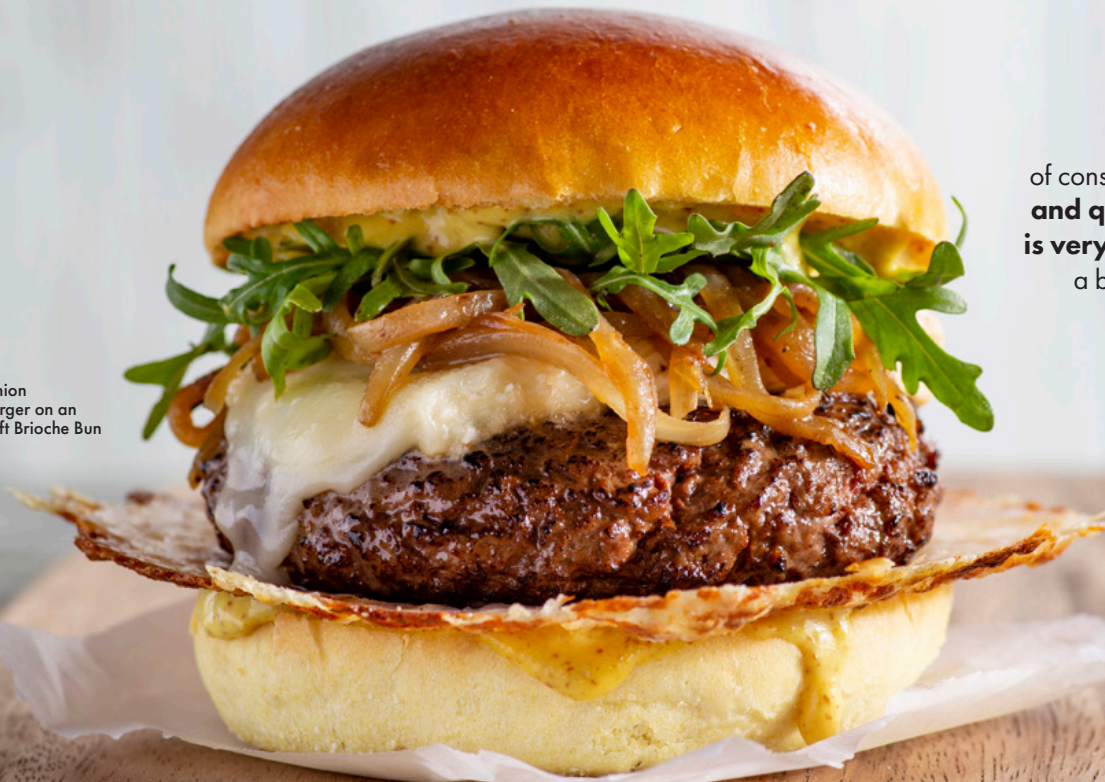
French Onion Cheeseburger on an ACE® Craft Brioche Bun

GO AHEAD, SQUEEZE OUR BUNS — THEY'LL ALWAYS BOUNCE BACK!