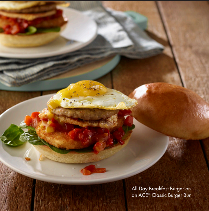
All Day Breakfast Burger on an ACE® Classic Burger Bun

ACE® burger buns offer a high, golden crown which provides maximum visual appeal and commands a higher price on your menu. Our buns have a soft bite, a clean flavor, and are resilient enough to stand up to toppings and sauces — especially during delivery.